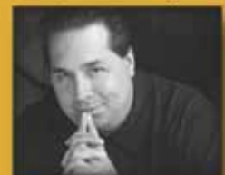
DJ & Entertainer