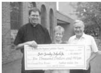
2007 RAFFLE WINNERS